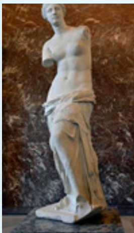
Alexander of Antiochia: Venus of Milo

Beauty is considered as a significant part in case of any artistic creation. Beauty in terms of art refers to an interaction between