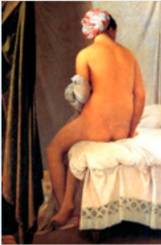
Jean-Auguste-Dominique Ingres: The bather of Valpinçon

The word "aesthetic" is derived from the Greek word "aisthetikos," meaning "esthetic, sensitive, or sentient". Aesthetics (also spelled esthetics) is a branch of philosophy dealing with the nature of beauty, art, and taste, and with the creation and appreciation of beauty. It is more scientifically defined as the study of sensory or sensory-emotional values, sometimes called judgment of sentiment and taste. More broadly, scholars in the field define aesthetics as 'critical reflection on art, culture and nature.' Aesthetics is a sub discipline of axiology, a branch of philosophy, and is closely associated with the philosophy of art. Aesthetic studies are new ways of seeing and of perceiving the world. Aesthetics is mainly concerned with the perception and sense of beauty. For Immanuel Kant, the aesthetic experience of beauty is a judgment of a subjective, but common, human truth.