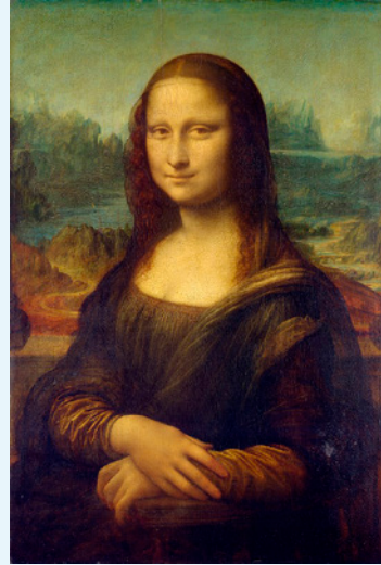
Leonardo da Vinci: Mona Lisa

The word "aesthetic" is derived from the Greek word "aisthetikos," meaning "esthetic, sensitive, or sentient". Aesthetics (also spelled esthetics) is a branch of philosophy dealing with the nature of beauty, art, and taste, and with the creation and appreciation of beauty. It is more scientifically defined as the study of sensory or sensory-emotional values, sometimes called judgment of sentiment and taste. More broadly, scholars in the field define aesthetics as 'critical reflection on art, culture and nature.' Aesthetics is a sub discipline of axiology, a branch of philosophy, and is closely associated with the philosophy of art. Aesthetic studies are new ways of seeing and of perceiving the world. Aesthetics is mainly concerned with the perception and sense of beauty. For Immanuel Kant, the aesthetic experience of beauty is a judgment of a subjective, but common, human truth.