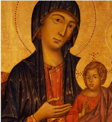
Cimabue: Virgin and Child Enthroned

Any field of Art plays a very significant role in elevating man's innovative ideas, aesthetic awareness and creative pursuit. Visual Arts provide an overall satisfaction and nourishment of the