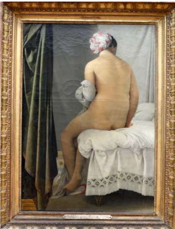
"The Valpicon Bather-Jean Auguste Dominique Ingres- 1808 "

Art stimulates the human mind and with it also enhances aesthetics and intensify creativity. The artist revolves around the cultured atmosphere of creation, inspiring him to transform mundane to ethereal. Art is truth, truth is art - as has been pronounced through the phrase Satyam Shivam Sundaram . The works of masters that are in the Louvre Museum, their beauty and majesty transcend us to a higher level of understanding. May the aesthetics of the Louvre illuminate our mind and enrich our lives, bring joy happiness and peace.