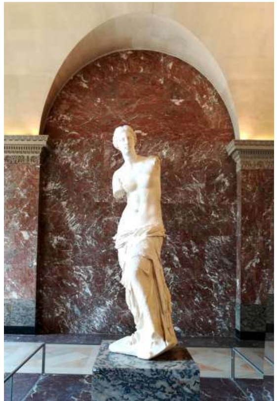
"Venus de Milo"

Sully Wing - The oldest part of the Louvre is Sully wing. On the third floor is a collection of French works of art - paintings, drawings, prints, etc. One of the most notable works is Jean Augustus Dominic's 18th-century oil painting 'The Turkish Bath'. The first and second floors of Sully have archaeological resources. Among the many artefacts and sculptures in 30 houses of Egyptian archaeology, are the famous 'Seated Scribe' and the gigantic statue of Pharaoh Ramesses which is a surprise to see. On the first floor, the Greek artefacts include 'Aphrodite' or 'Venus the