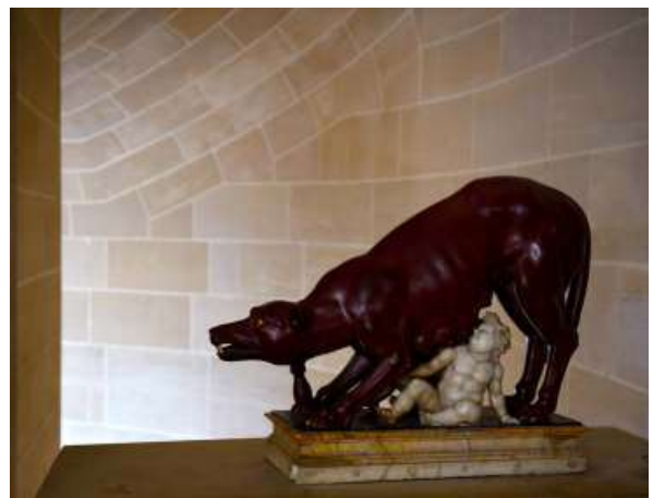
"The Wolf Sucking Romulus and Remus"

there is the house of Napoleon III, beautifully decorated with expensive objects. From this it can be inferred that Louvre was like the interior of the palace when it was there. At the collection of sculptures of the first and the underground floor – one finds two wide spaces wrapped in glass arranged around the work of Cure Peugeot and Cure Marley. In the 18th century, Gil Kustar created a huge marble sculpture, Cure Marley, a stable for horses, a mourner, and a plaintiff near Philip Pot's tomb. On the first floor there is a collection of ancient art from the near east. Note: The Code of Hammurabi is a large basalt stall of eighteenth-century Babylonian law.