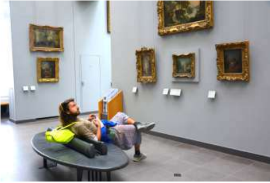
"Food For Thought "