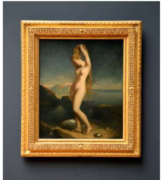
"Marine VENUS 1838"

We woke up late the next morning and left for Louvre Museum at 10 o'clock, by metro. After entering through the back of the museum and initially could not work out where to buy the entrance ticket. Many people were entering but no ticket counter was to be found. Some beautiful statues could be seen from outside. After wandering around for some time, we finally came to the huge open space inside. There was the famous glass pyramid, towards the main entrance and many people crowded there. However, no entrance for the actual museum could be found there. On enquiring, we came to know that the museum remains closed on every Tuesday and that was Tuesday and we were naturally disappointed. The Louvre Museum was a special attraction for us. Fortunately we were staying in Paris for the next couple of days. So for rest