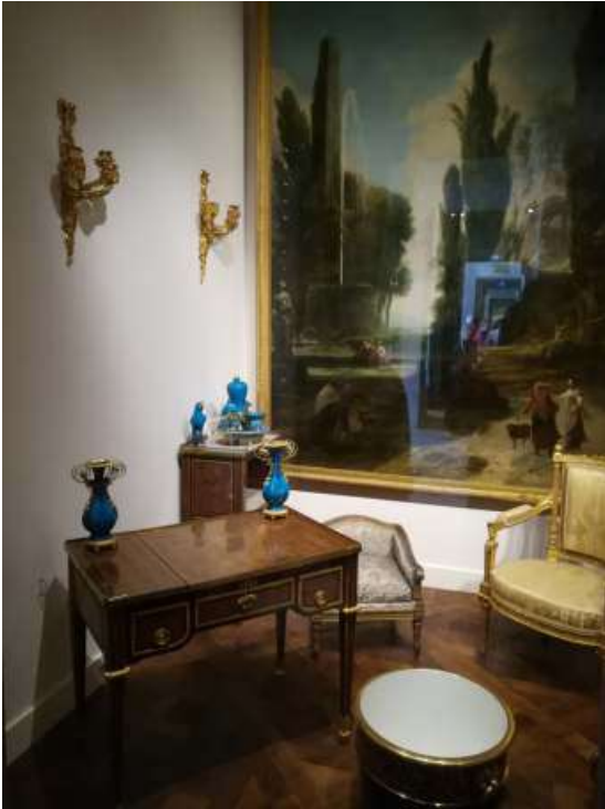
"Writing Table of Louis XIV " MRINAL BANDYOPADHYAY

notably among them are Louvre Museum, Picasso Museum, Orse Museum and Pompidou Center, Montmartre Museum, house of Claude Monet and Van Gogh are some of the places of special interest, but Louvre Museum is the jewel in the crown so far as art and sculpture is concerned. My discussion, therefore, is mainly about Louvre Museum.