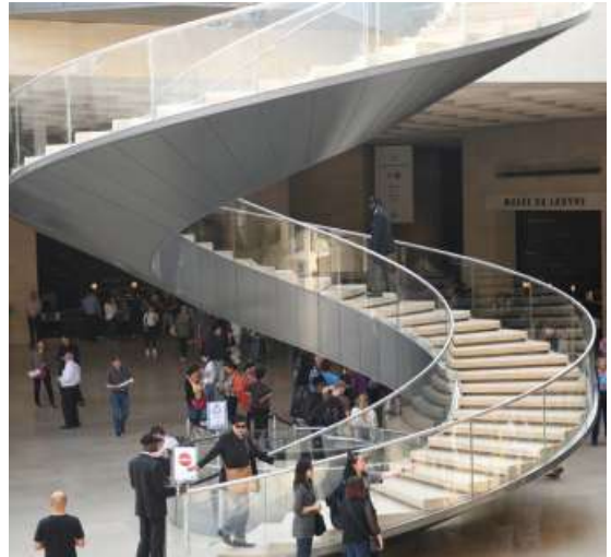
"Spiral at LUVRE"

Richelieu Wing - The third floor of the Richelieu section features European art from the Middle Ages to the nineteenth century. Notable among them are the paintings of the eminent painters Reuben and Rembrandt. Of particular note are Jan Vermeer's Lesmaker and Jan Van Icke's fifteenth-century work The Virgin of Chancellor Ronla . On the second floor of the Richelieu there is a store of decorative art, such as clocks, furniture, porcelain items and tapestries. On the same floor